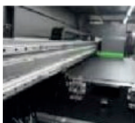
Magnetic Linear Rail System