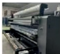
Inbuilt Multi-roller Feeding System