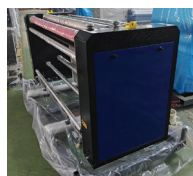
Modular Feeding System

* All trademarks mentioned are the property of their respective owners and have been mentioned herein for reference purpose only.