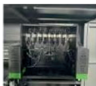
Negative Pressure Ink System