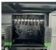
Negative Pressure Ink System