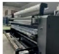
Inbuilt Multi-roller Feeding System