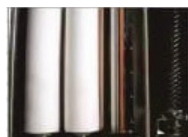
Belt Cleaning Device