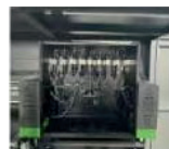
Negative Pressure Ink System