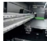
Magnetic Linear Rail System