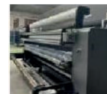
Multi-Roller Feeding System

* All trademarks mentioned are the property of their respective owners and have been mentioned herein for reference purpose only.